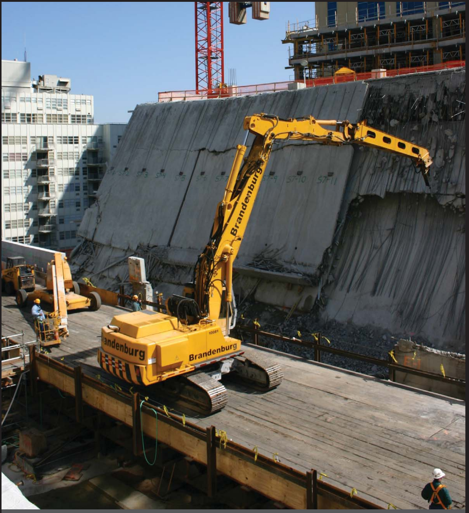
TROPICANA PARKING GARAGE ATLANTIC CITY, NEW JERSEY